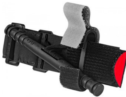
Figure 4.3 – Self-application tourniquet

The rise in knife crime and threat of terrorism leads to a risk of catastrophic bleeding to injured officers, staff and members of the public. SATs were developed by the military during the Iraq and Afghanistan conflicts, and are designed to provide a simple tourniquet that can be self-applied with a single hand. In policing, their role is two-fold: firstly, for application to casualties who are experiencing catastrophic bleeding in a limb; and secondly, for officers to self-apply to their own limbs, if they are experiencing a catastrophic bleed (self-aid).