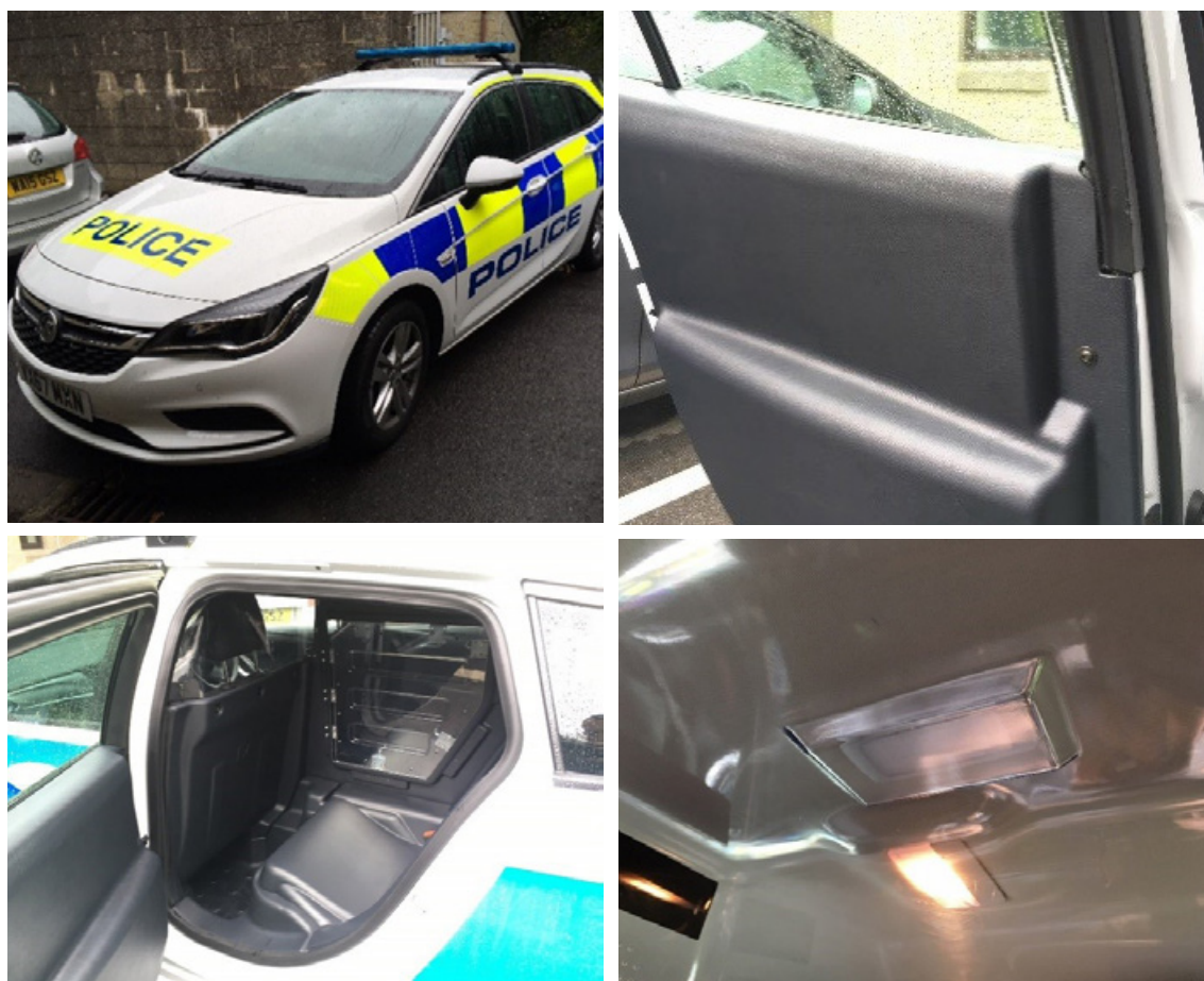
Figure 4.2 – Bubble car solution

North Wales Police deploy these bubble cars as its entire fleet of patrol cars, and has done so for many years. Other forces, such as Hertfordshire or Avon and Somerset, deploy some bubble cars as part of a mixed fleet of patrol cars.