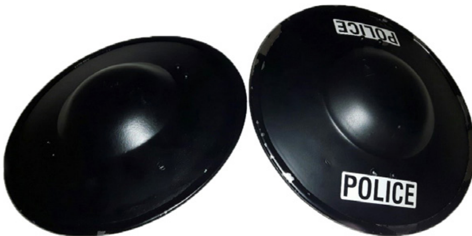
Figure 4.1 – Personal safety shield

Between April 2018 and May 2019, approximately 12,500 MPS officers attended PST, which included an input on the use of the PSS in defending against a knife-armed attacker. Feedback has yet to be analysed for the MPS's Officer Safety Board and Self Defence, Arrest and Restraint (SDAR), but the early indications are reported to be positive.